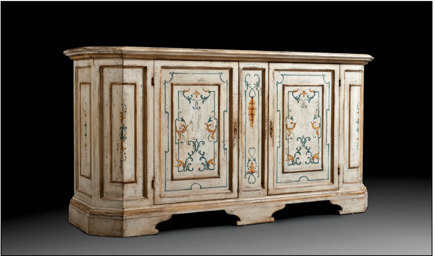
BAR-3 Hand Painted Credenza 87"W X 23"D X 45"H